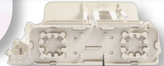
Fiber Splice Tray